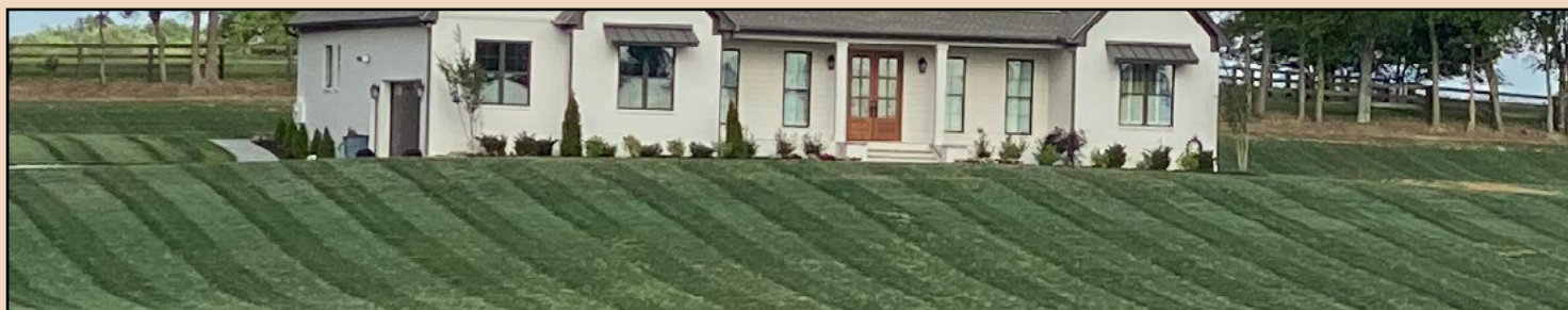
A Blue Gem Texas Bluegrass lawn