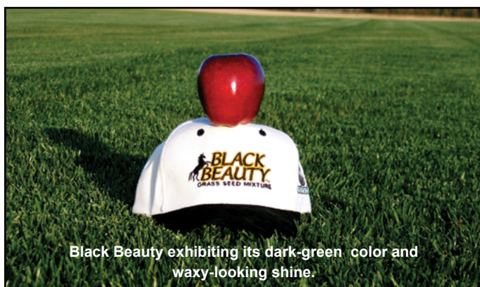
Black Beauty exhibiting its dark-green color and waxy-looking shine.